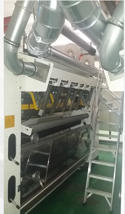
Blown film for food packaging