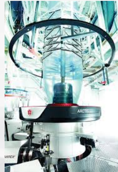
W&H Blown Film Machine