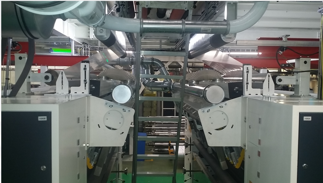
2x Xstream dust removal module with iONstream FUSION, 6kV electrostatic neutralising bars working width 2200mm