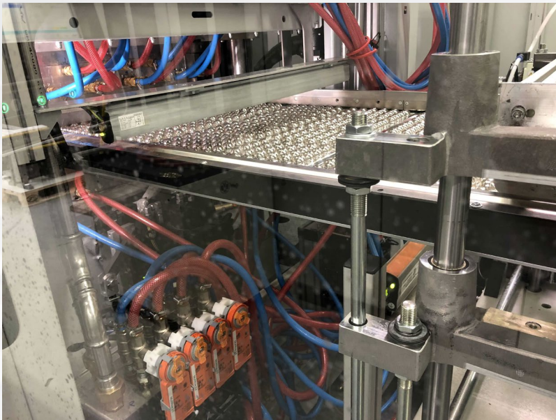
2x iONstream FUSION, 12kV, 860mm Electrostatic discharging bars