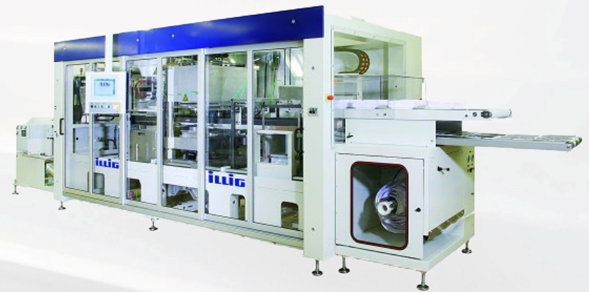
ILLIG RV53d Thermoforming Machine