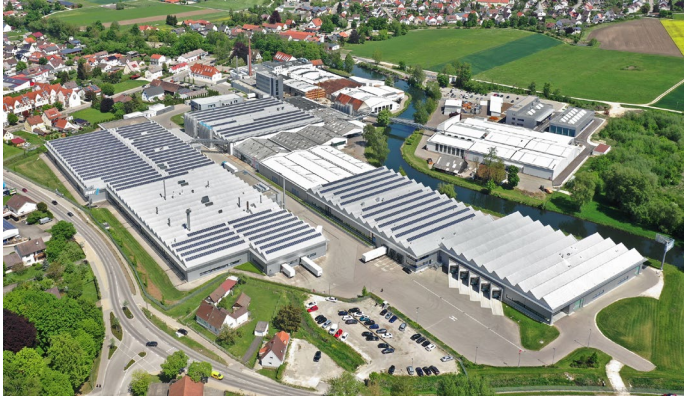
BWF Group Offingen

The BWF Group is a fifth-generation owner-managed group of companies headquartered in Offingen, Bavaria. With 1,800 employees at 16 production sites worldwide, we set international standards through innovation, competence and commitment.